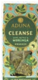
94781 – Aduna - Cleanse Tea - Moringa Mint & Nettle, 15 Bags x 3 – RSP £4.99