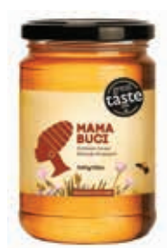
95430 – Mama Buci - Zambia Forest Honey Winter Harvest, 340g x 6 – RSP £5.99