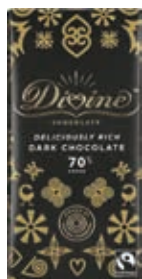
93865 – Divine - 70% Dark Chocolate, 1 x (30 x 35g) - RSP £1.10

Here are a few of our African-inspired product picks: