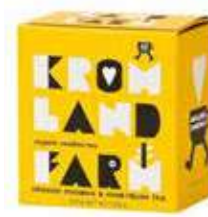
81404 – Kromland Farm - Rooibos & Honeybush Organic Tea, 40 Bags – RSP £2.99