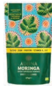
80911 – Aduna - 100% Organic Moringa Superfruit Powder, 275g – RSP £13.99