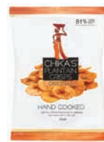
81184 – Chikas - Hand Cooked Plantain Crisp, 35g x 12 – RSP £1.39