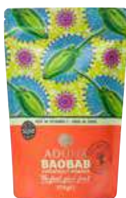
80910 – Aduna - 100% Organic Baobab Superfruit Powder, 275g – RSP £12.99