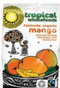
63243 – Tropical Wholefoods - Mango - Organic, 100g x 14 – RSP £2.79