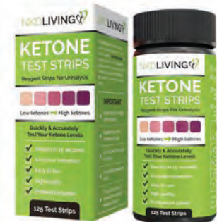
96781 – NKD Living Ketone Test Strips, 125 Test Strips – RSP £6.99