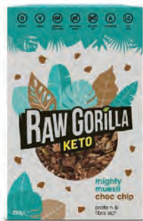
702012 – Raw Gorilla Keto Mighty Muesli, 250g – RSP £6.29