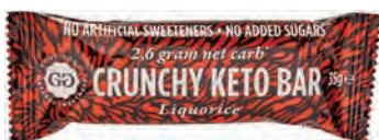
91782 – Good Good Liquorice Crunchy Keto Bar, 35g – RSP £1.99