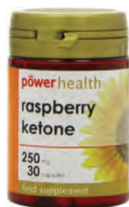
74707 – Power Health Raspberry Ketone, 30s – RSP £7.99