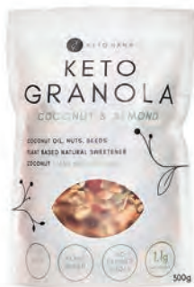
701498 – Keto Hana Keto Friendly Granola - Coconut & Almond, 300g – RSP £6.99

With the increase in popularity of the diet, manufacturers have started to develop keto-friendly products to help consumers follow this challenging diet and clearly label them as such. Here are a few of top keto-friendly product suggestions: