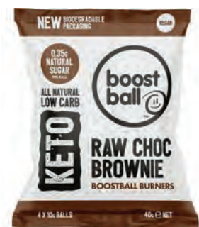
700765 – Boostball Chocolate Brownie Keto Boostball Burners, 40g – RSP £2.00