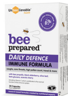
71315 – Unbelievable Health Immune Support Max Capsules, 20s - RSP £11.99