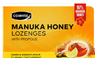
90321 – Pure Manuka Honey Lozenges Lemon & Ginger, 8 Pack - RSP £6.99