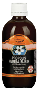
86595 – Comvita Propolis Herbal Elixir, 200ml - RSP £17.99