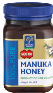
41986 – Manuka Health Manuka Honey Mgo 400 (20+), 500g - RSP £69.99