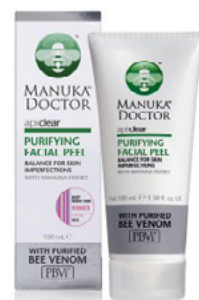
74500 – Manuka Doctor Bee Venom Face Mask, 50g - RSP £50.49