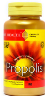
80260 – Bee Health Propolis 1000mg Capsules, 90s - RSP £12.48