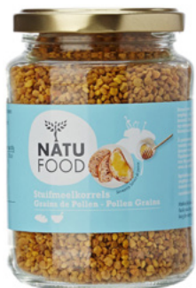
88389 – Natufood Pollen Grains, 225g - RSP £9.36