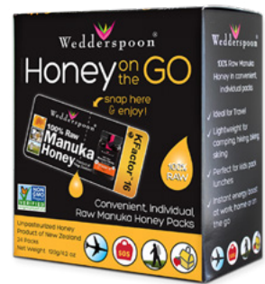
90318 – Wedderspoon Honey on the go Manuka Honey Snap Packs, 120g - RSP £18.99