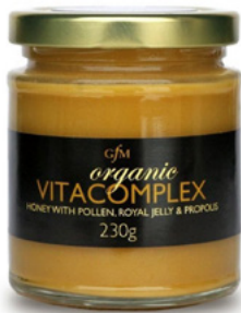
69155 – GFM Vitacomplex - Honey Pollen Royal Jelly & Propolis, 230g - RSP £6.25

Here are a few of our favourite bee products;