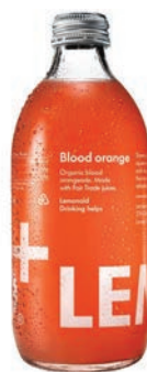
81703 – Lemonaid Blood Orange - Organic & Fairtrade, 330ml – RSP £1.79