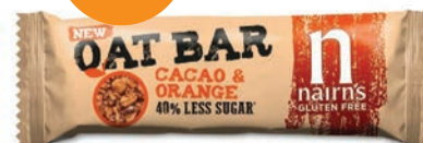
95306 – Nairns Cacao & Orange Gluten Free Oat Bars, 40g – RSP £0.89