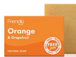
704469 – Friendly Soap Orange & Grapefruit Soap, 95g – RSP £2.45