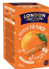
704401 – London Fruit & Herb Co Spiced Orange Tea, 20 Bags – RSP £1.59