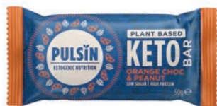
700424 – Pulsin Choc Orange & Peanut Keto Bar, 50g – RSP £1.99