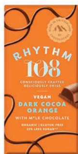
704019 – Rhythm 108 Orange Cacao Swiss Chocolate Tablet, 100g – RSP £3.99

We've pulled together our top orange flavoured products for your store: