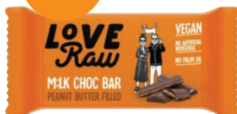
704730 – Love Raw Vegan Milk Chocolate Bar – Orange, 30g – RSP £1.69